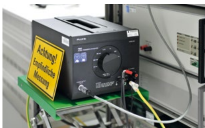
Calibration of a Fluke 5790A