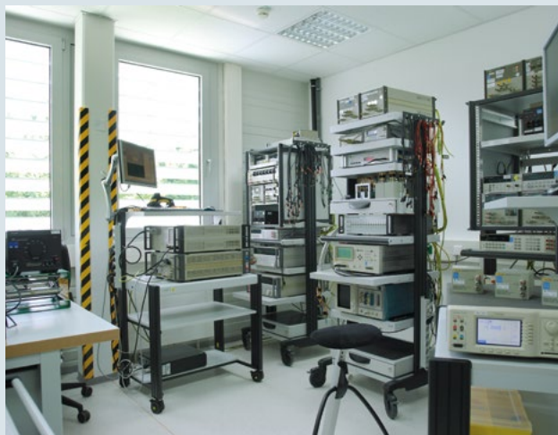
High-quality references at the electrical primary laboratory