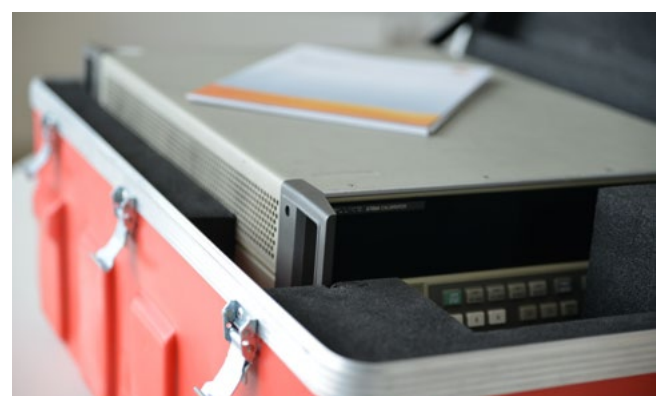
Spezial-Transportboxen für den Transport elektrischer Referenzen