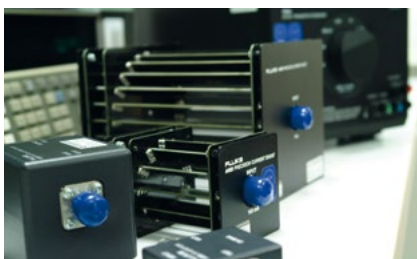
Reference standards for alternating current power