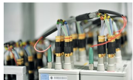
Resistances and shunts